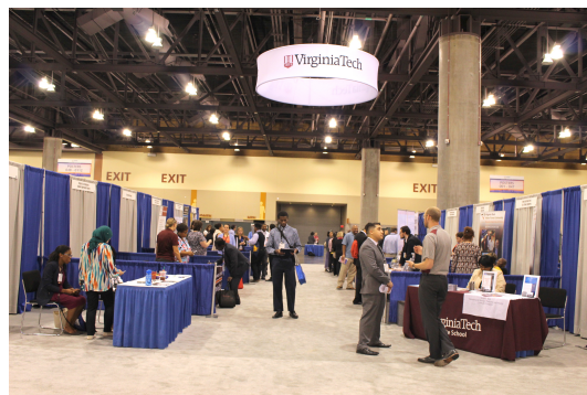
In the picture above is the "Hokie Aisle" in the Exhibitors' Hall". The banner was provided by ICTAS. The VTCRI/TBMH/Medical School booth is