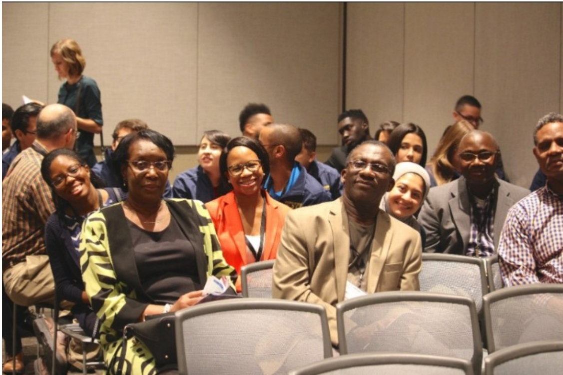
The PREP/IMSD attendees at the Pre - Conference "PREP Networking Event"